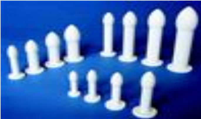
Vaginal Dilator Sets, Product ID: DT-A, DT-8, DT-C